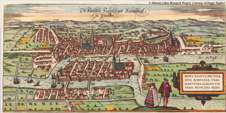
Seven bridges of Königsberg.